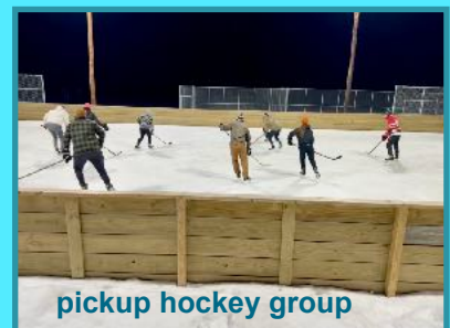
pickup hockey group