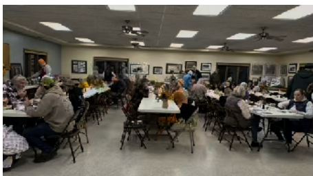
2024 Hunter's Supper

The Wabana Community Fund's 2024 Hunter's Supper raised $2,716 that will be used to support the community scholarship program, the annual ice cream social, and funeral lunches. Once again, the turnout was great. Without all of the volunteers who helped, it would not be possible to provide this delicious meal which raises funds for the community. Thank you for attending to enjoy the meal and support your community, and thanks to all the volunteers who make it happen.