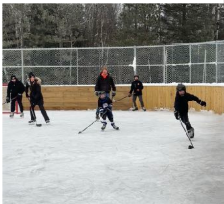
Great to see people enjoying the new hockey rink.