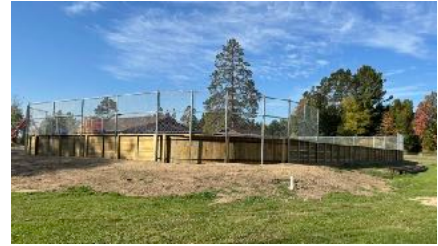
New Hockey Rink

Daylight Savings Time ends Sunday, Nov. 3 - turn your clocks back one hour.