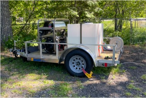
Wabana Boat Wash Station @ Town Hall